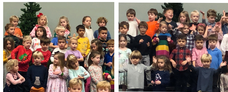
Fours and fives from the Weekday School charmed the audience with Christmas songs, complete with movements.