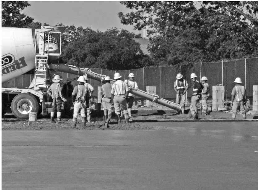
After days of rain, the weather cooperated long enough for workers to start pouring concrete for the new parking lot.