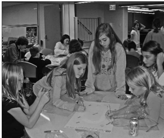
Youngsters work on a project during activity time at October's BIG Time gathering.