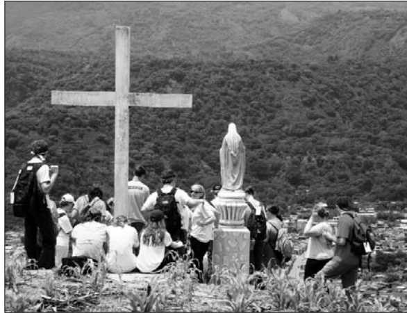
The UPUMC group climbed a steep hill overlooking San Juan for a quiet time and devotional.

I will not speak for everyone who went, but I saw God in Guatemala, in the abundance of love and joy in which we were bathed. I saw God in the youth and the adult leaders whose energy