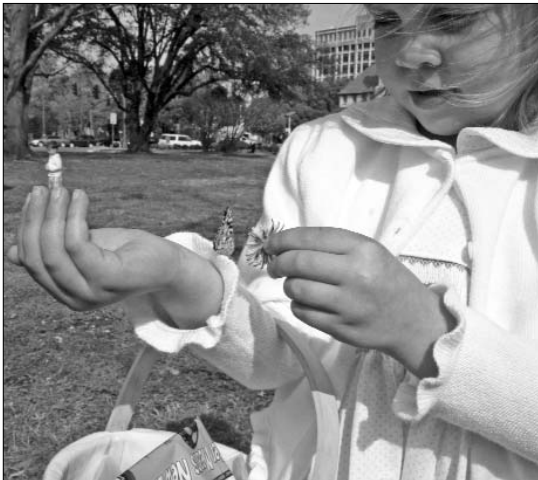
The Children's Easter Celebration on Easter Sunday will include a butterfly release and egg hunt. Turn to 4A for a complete list of Holy Week and Easter events.