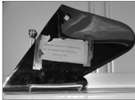
This plowshare was used to break ground on a new educational building in 1954.