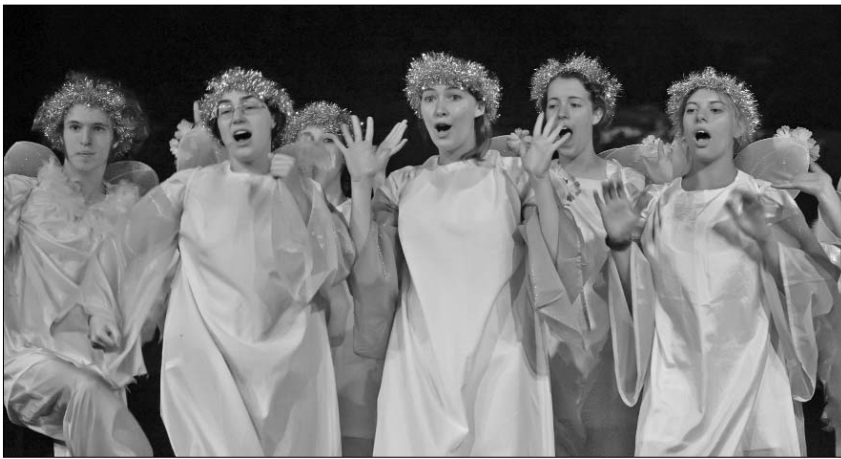
The Aldersgate Chorale has completed the Final Act tour. See more photos on page 4.