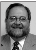
Embrace the winds of change