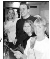
2004 kitchen crew

Proceeds benefit Project Transformation, a grassroots, faith-based nonprofit based in Oak Cliff. Project Transformation provides socially conscious leadership training and ministry exploration for youth adults, and it offers community-oriented programs for children and youth living in Dallas and surrounding low-income neighborhoods. Read more at www.projecttransformation.org .