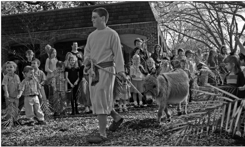
Children and youth reenacted Jesus' arrival to Jerusalem in a palm processional during the Sunday school hour on March 16. See page 5A for a full schedule of Easter activities and worship.